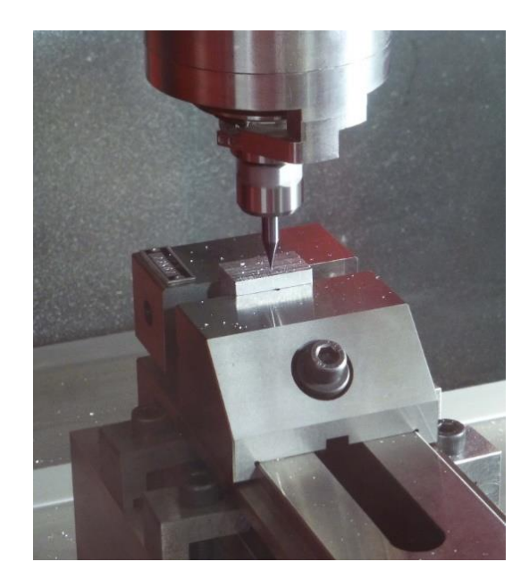
Figure 1. Experimental setup for micromilling of channels in ultrafine-grained metals.

ultrafine-grained metals were used during the tests: low-carbon steel with 216 HV and 0.7 \mu m grain size, stainless steel with 470 HV and 0.2 \mu m grain size, and an aluminium with 117 HV and 1 \mu m grain size. Dry conditions were used during all experiments. Quantitative results were evaluated by using Analysis of Variance (ANOVA), statistical significance \beta =5%, and two replicates to determinate the effect of cutting parameters and materials on quality and accuracy of manufactured microchannels.